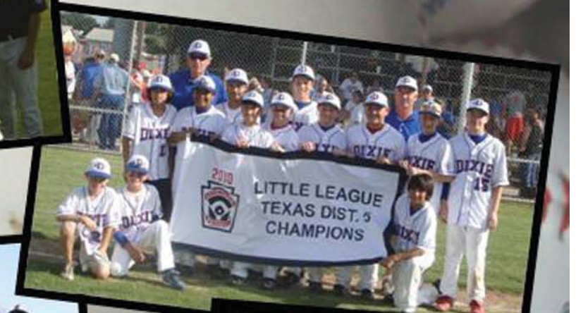
11-12 Year Old - Dixie