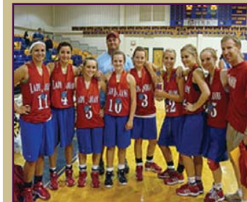
JIM NED RED LADY INDIANS

“The Abilene Youth Sports Authority is founded on Christian principles and exists to promote the highest ideals of teamwork, sportsmanship, honesty, trust, and respect for authority with the specific purpose of influencing kids and adults to become better individuals.”