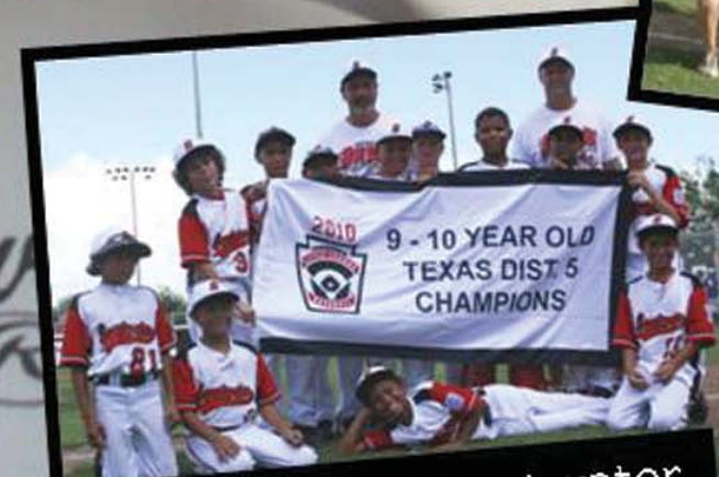
9-10 Year Old - Sweetwater