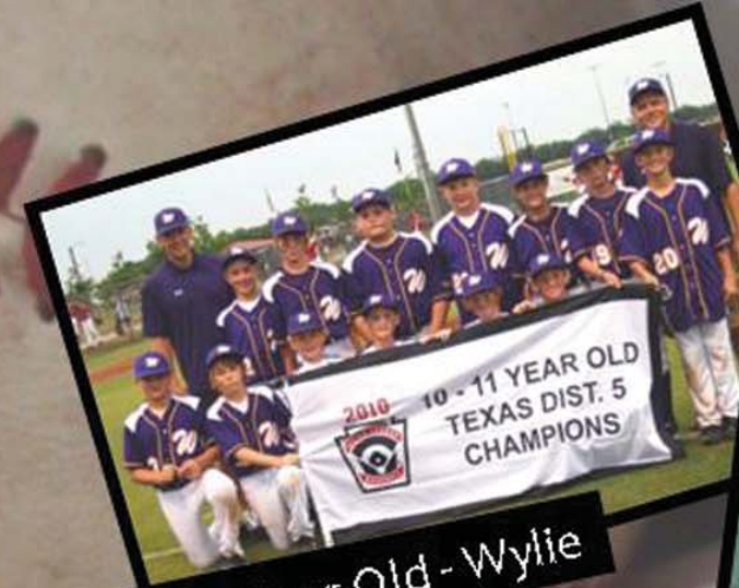
10-11 Year Old - Wylie