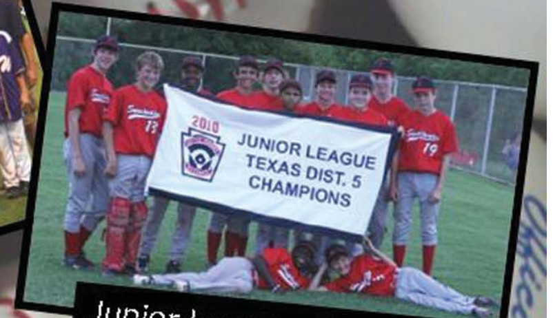
Junior League - Sweetwater