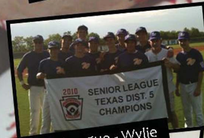
Senior League - Wylie