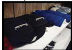
Sports Socks $.50